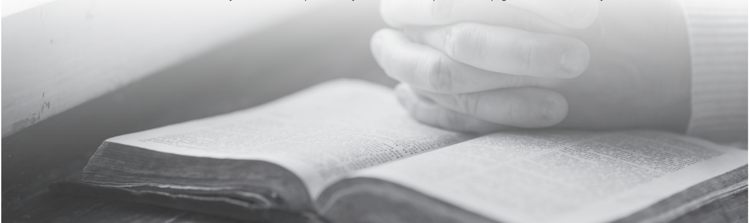
Listed are names of those family and friends who passed away in 2022 that were printed in the pages of the Maries County Advocate.